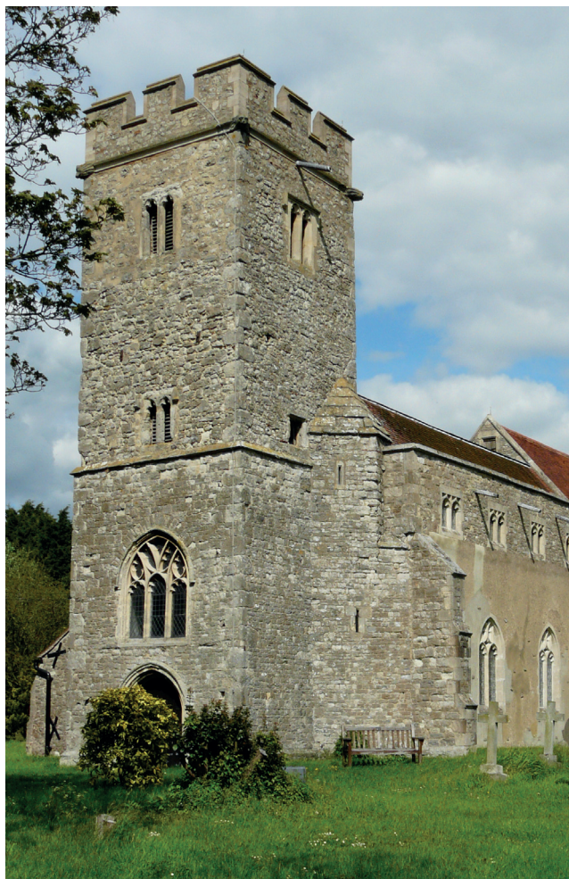
Chimney repairs at Rawreth, St Nicholas.

Supporting Churches in Essex and East London