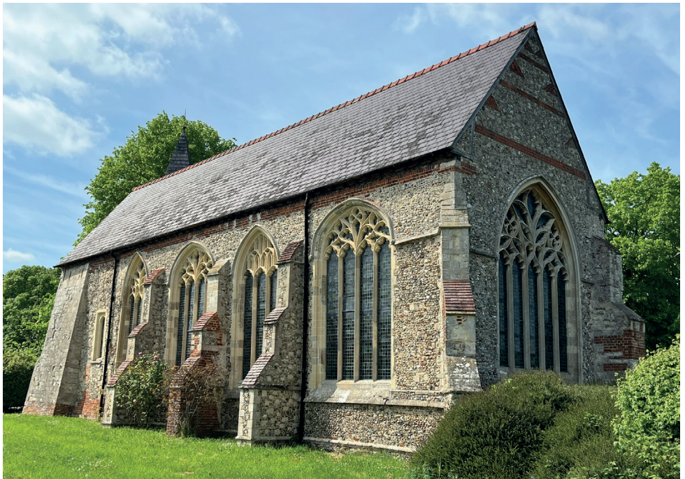
Little Dunmow, St Mary the Virgin.