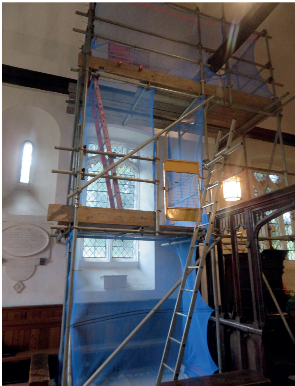
Ceiling plaster repairs at Stondon Massey, SS Peter and Paul.