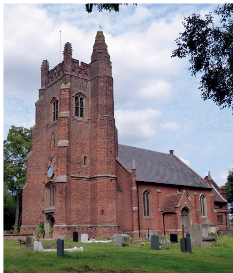
Rayne, All Saints.