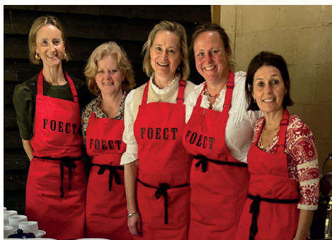
Members of the Events Committee ready for action at the Open Garden event at Little Bentley Hall in June 2024.