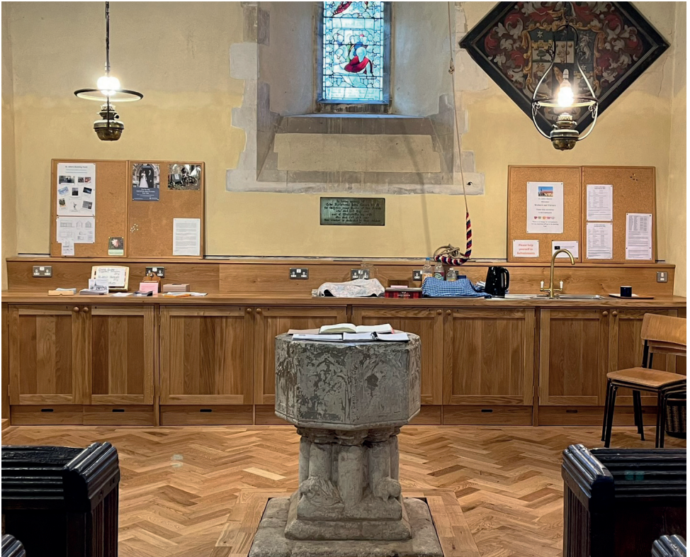
Provision of servery and lavatories at Little Leighs, St John the Evangelist.